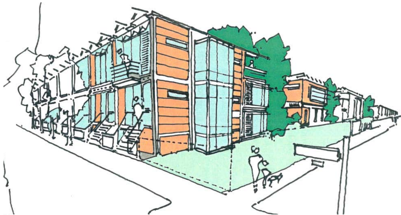
Above: housing: Buchholz-West

Pringle Richards Sharratt first worked in Berlin on a project for model housing at the 2001 building exhibition on a site at Buchholz-West, sponsored by the City of Berlin. As a result of this, the practice was invited by a major housing developer – Gesobau – to enter a competition for new housing at Westend, Berlin-Charlottenburg, close to the Olympic Stadium. The design won the competition and included a mixture of single family houses and maisonettes.