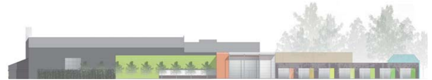
Feltham Airparks - proposed north elevation