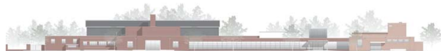
Isleworth - proposed south east elevation