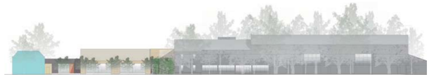
Feltham Airparks - proposed south elevation