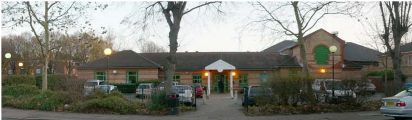
Chiswick New Pool - existing leisure centre - main facade