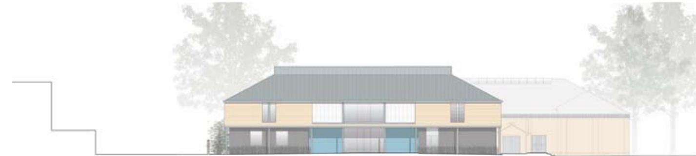
Chiswick New Pool - proposed main facade