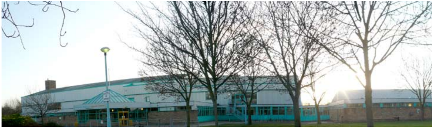
Feltham Airparks - existing leisure centre - north elevation