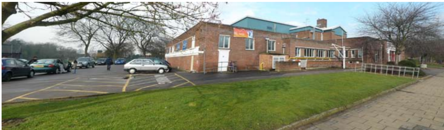
Isleworth - existing main facade