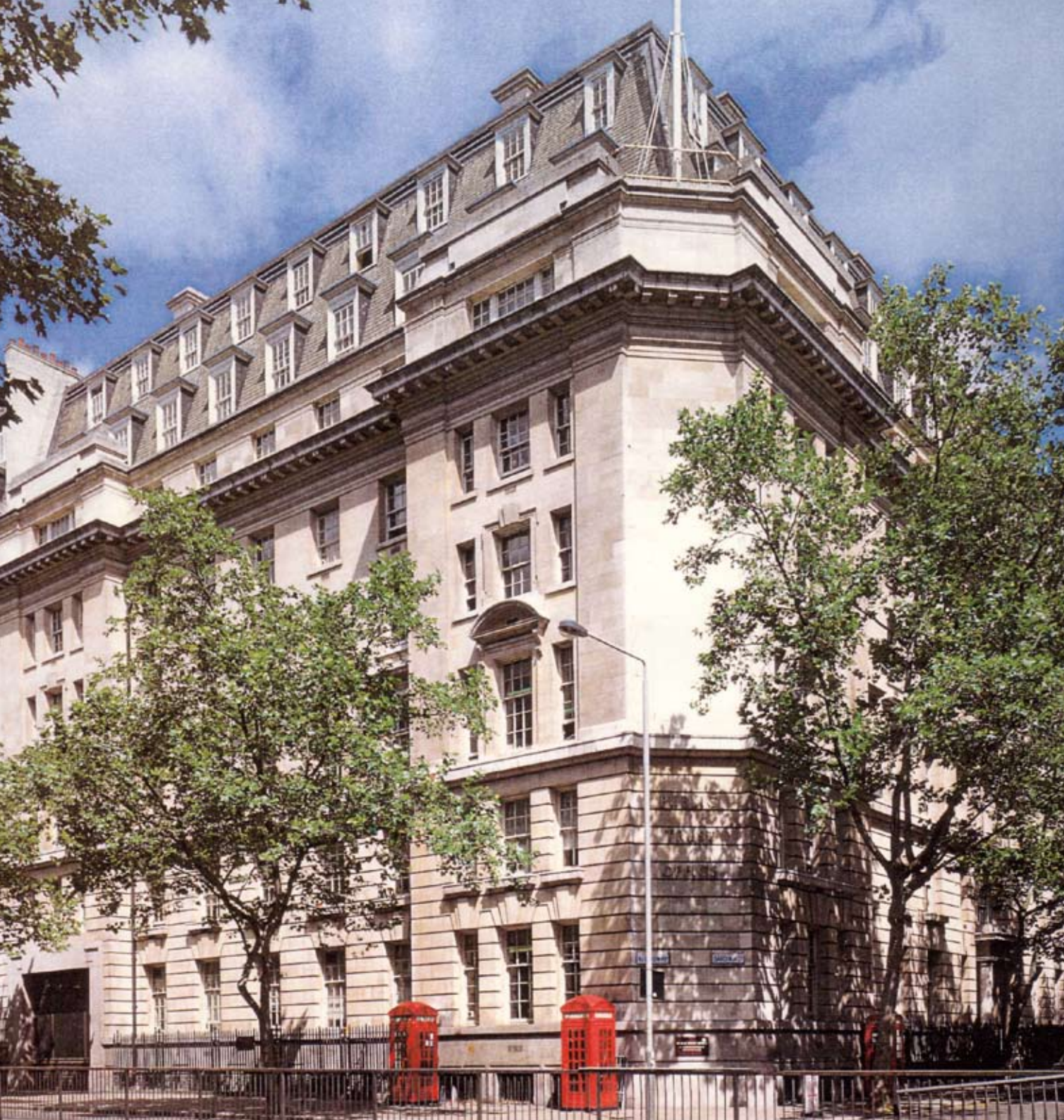
LONDON SCHOOL OF ECONOMICS & POLITICAL SCIENCE, 24 KINGSWAY MASTERPLAN, LONDON