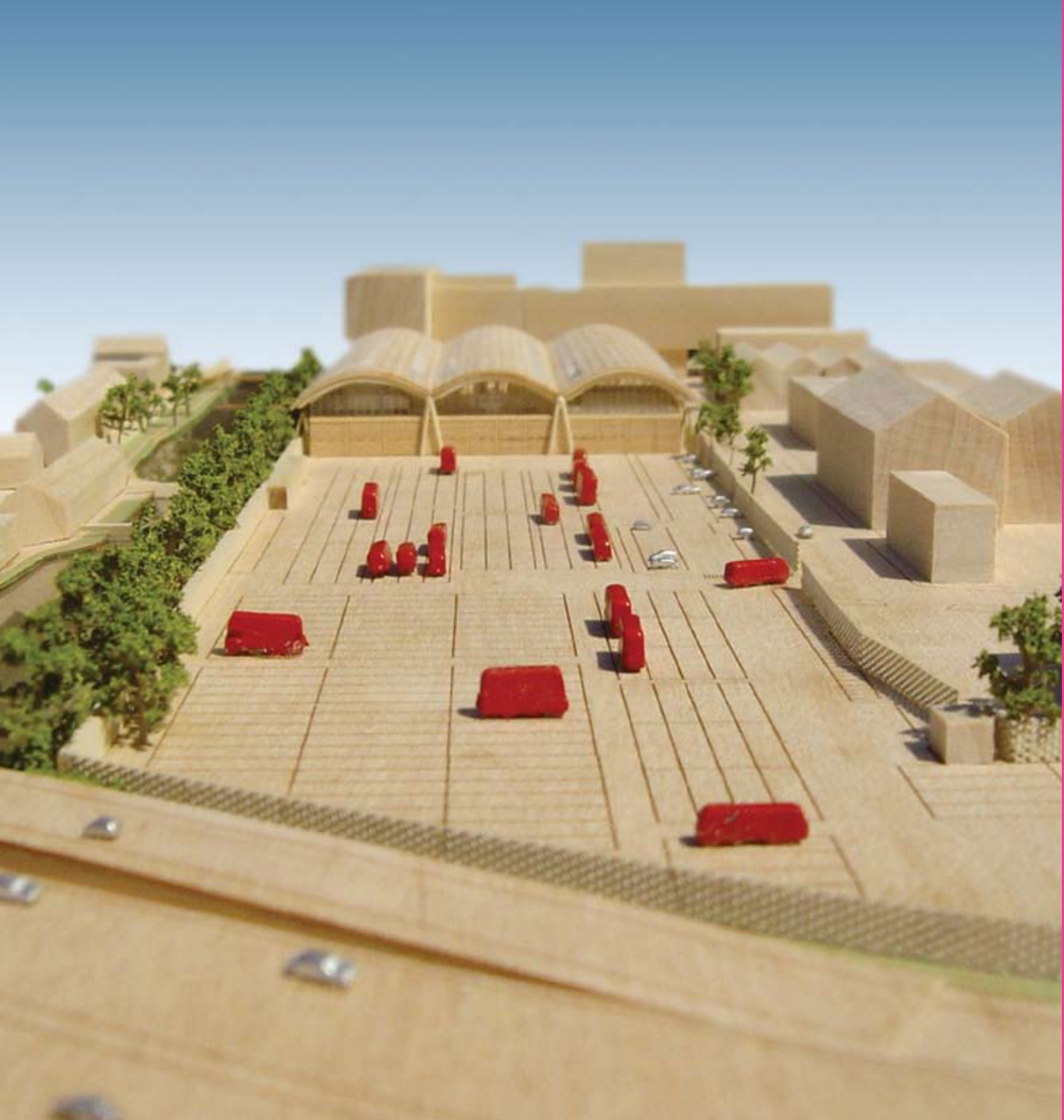
WYKE ROAD BUS GARAGE, LONDON