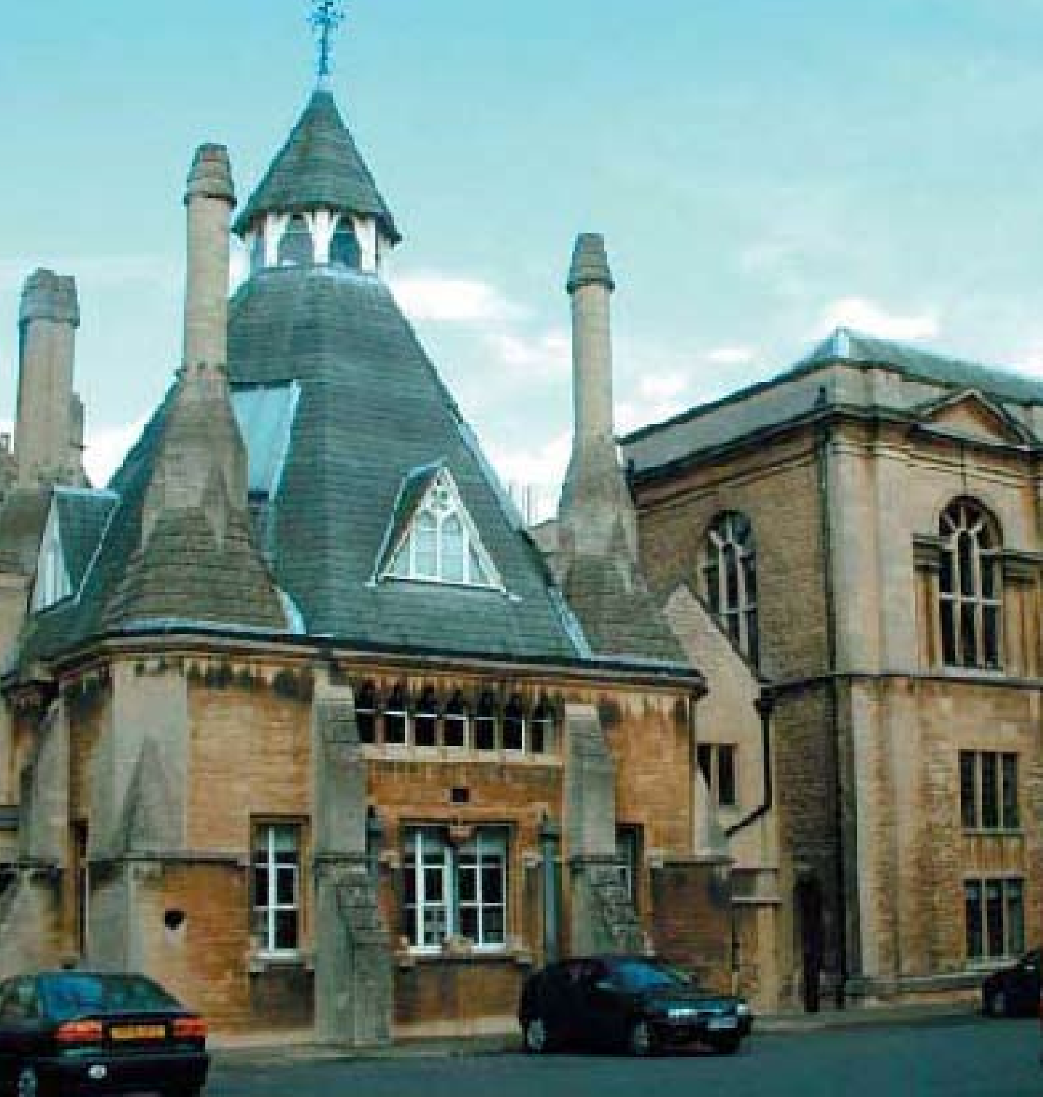
OXFORD UNIVERSITY, RADCLIFFE SCIENCE LIBRARY, OXFORD