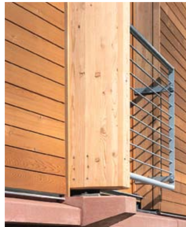
Shrewsbury School 1,254 m 2 £1.4 million 1991-2005 RIBA Award for Architecture 2001, Civic Trust Award Commendation 2003, Brick Award Commendation 2002, shortlisted for 2001 BCIA Awards and Timber Industry Awards, nominated for the RIBA Sustainability Award, Shrewsbury & Atcham Design & Heritage Award 2001.