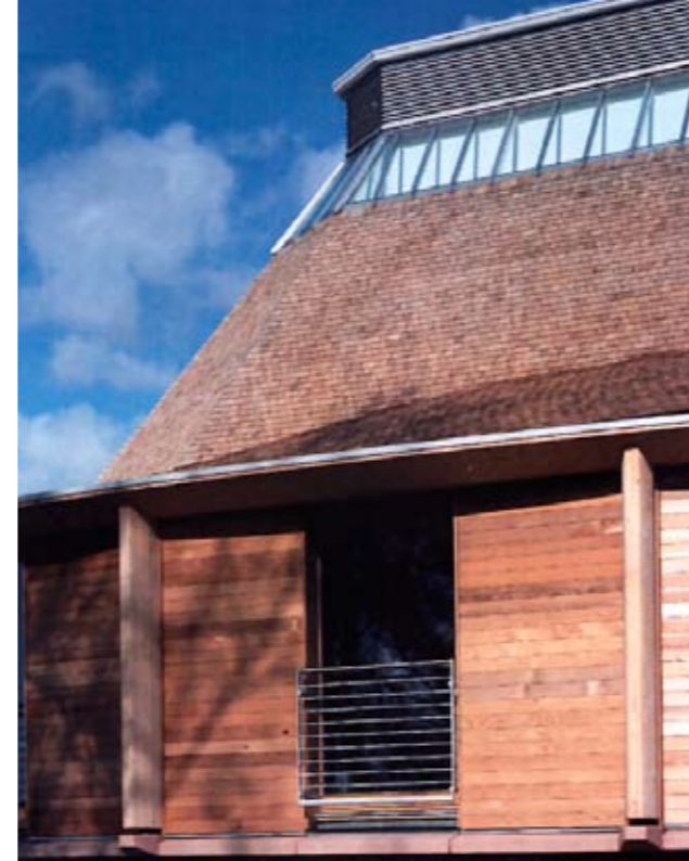
Left: western red cedar shingle roof and timber cladding