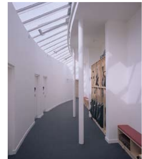
Above: rooflit internal circulation route with storage for musical instruments

“This is a building that lifts the spirits ... it is contemporary yet it has the feeling of always having been there – it’s a timeless building which has roots ... organic, not genetically modified!” The Prince of Wales when he opened the building in February 2001