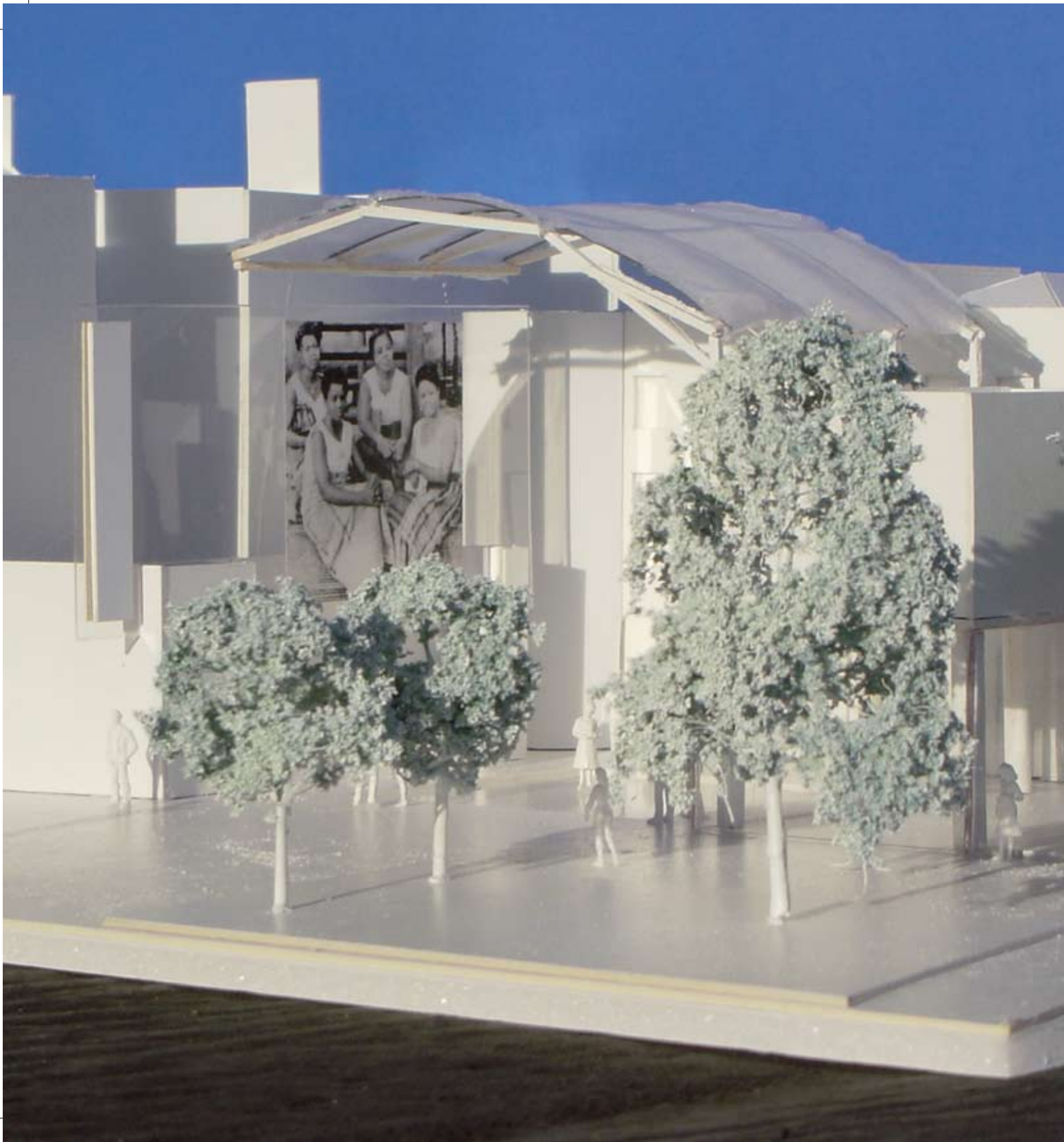
BLACK CULTURAL ARCHIVE BRIXTON, LONDON