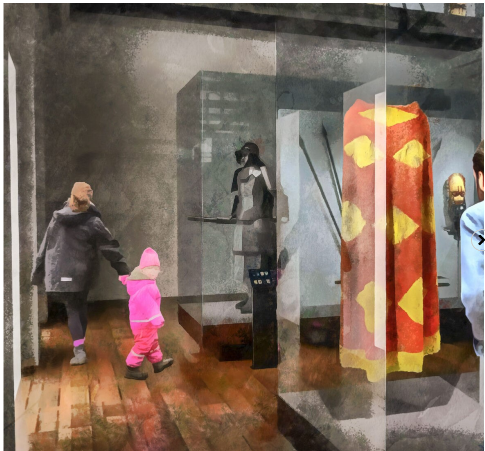
1/3 Pringle Richard Sharratt's concept proposals for Ipswich Museum (April 2020)

Pringle Richards Sharratt is to lead the £8.6 million overhaul of the Grade II*-listed Ipswich Museum