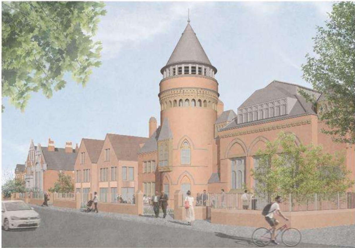
Image of how the Ladywell Playtower will look from the station

Planning application to convert Ladywell landmark into a cinema will be submitted 'within weeks'