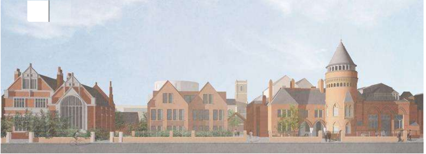
Ladywell Playtower: proposed street elevation

It closed in 2004 and after a fire became one of Historic England's top 10 at-risk listed buildings. By 2015 it was on the Victorian Society's 'most endangered' list . The estimated cost to restore the former baths is around £8m.